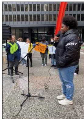
Paradise advocates for environmental justice for West Side communities.