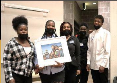
Physics students present their work on the "Solar Community Project" at UIC's Youth Participatory Science Conference. Youth researchers representing schools across the city voted for this presentation to receive the "Community Reclaimers" award.